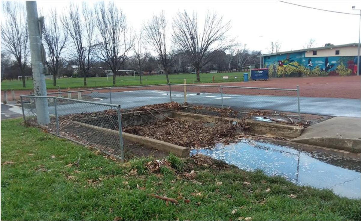
Stormwater culvert above GPT at Neuman Street 5 November 2024