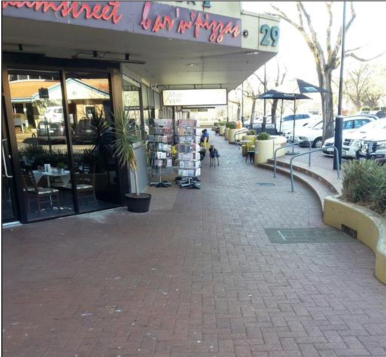
Bentham Street (north side) – from west