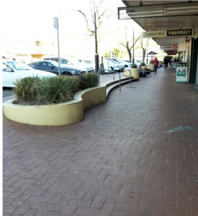
Bentham Street (north side) from east